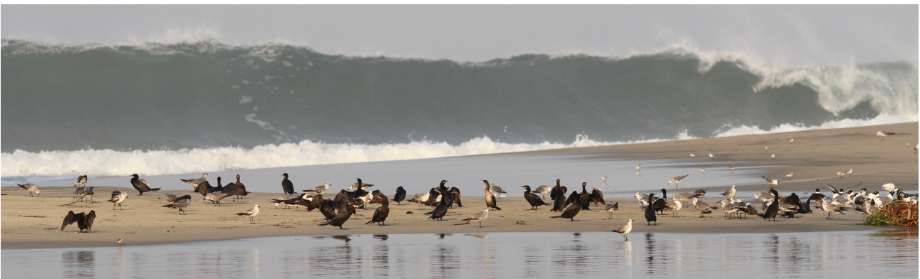
Neotropic Cormorants, Sanderlings, Laughing Gulls, Black Skimmers, where the lagoon meets the ocean.

04/09: I go to the delta of the Colotepec River some km east of Puerto Escondido.