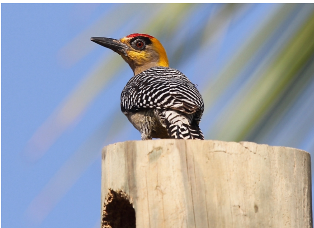
Golden-cheeked Woodpecker daily in PE (more common than 2016)