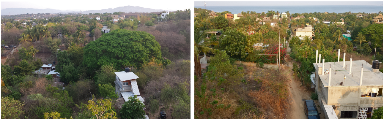
Outlook from the roof of „Villa Rucaani“

Puerto Escondido is growing, there are some new houses and less bushes around „our“ house. But still there are many birds to see. And the people of Oaxaca are still very friendly!