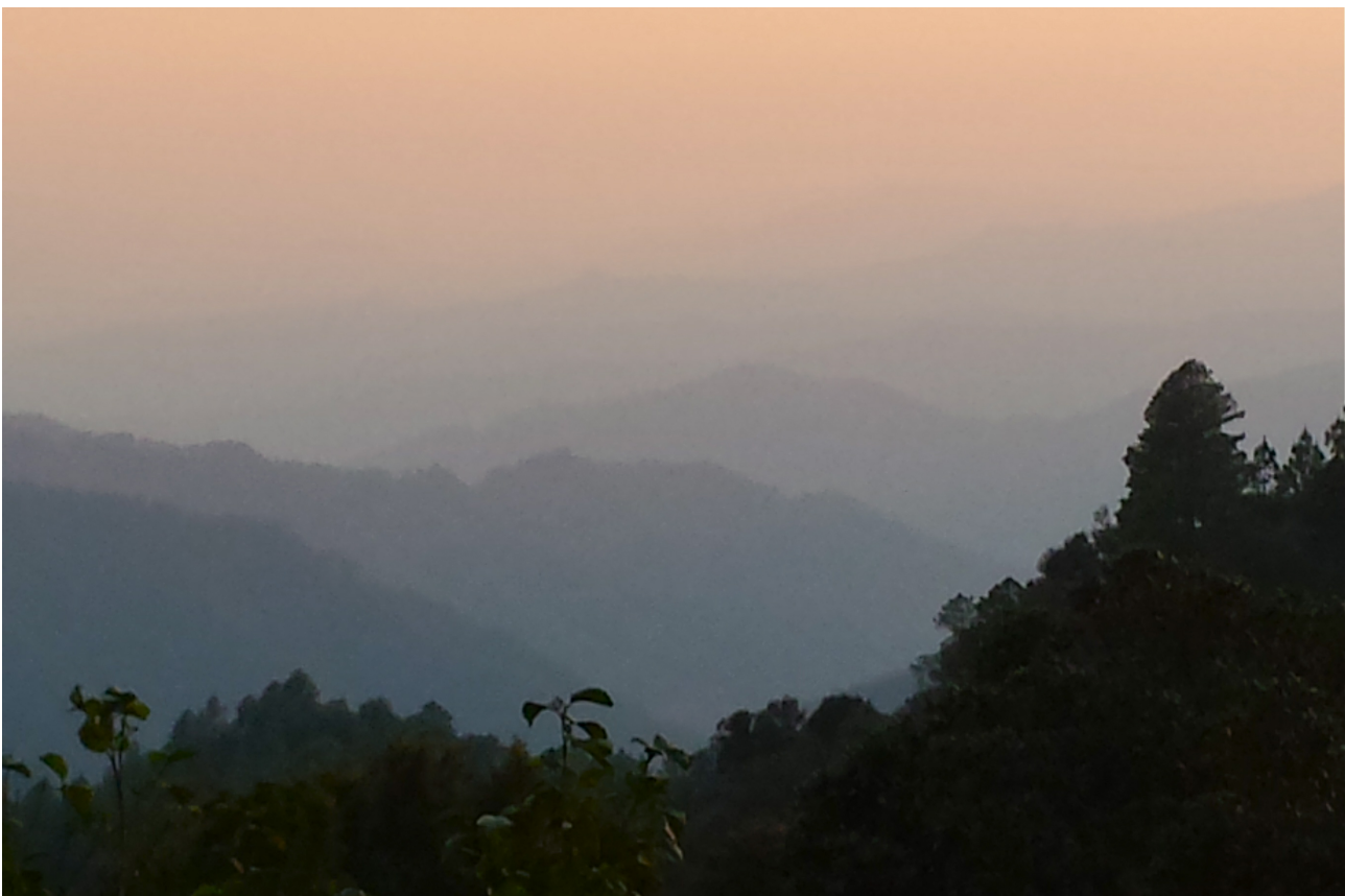
Quiet evening at the „Terraza de la Tierra“.

04/15-17: Drive to the „ Refugio Terraza de la Tierra “ near San José del Pacifico north of Pochutla. Beautiful forest at 2300 m altitude, totally different from all we have seen before in Oaxaca. We stay two nights, do some walks around and enjoy the tranquillity.