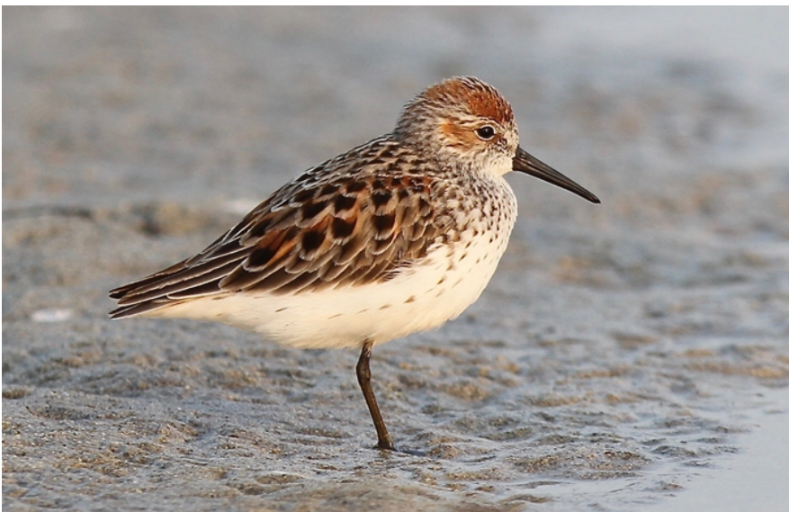
Western Sandpiper 04/09 3-4+ Colotepec rivermouth