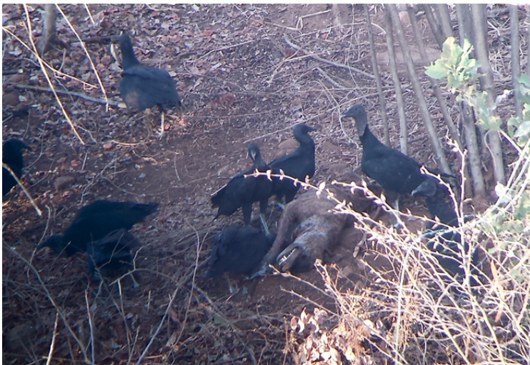
Black Vultures eating dog near Villa Rucaani