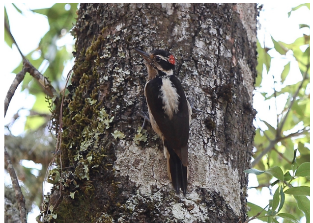
Hairy Woodpecker 04/16 1+ Terraza de la Tierra