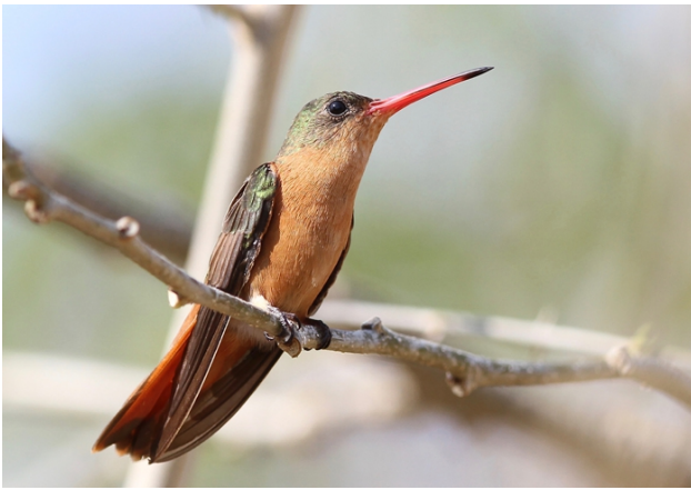
Cinnamon Hummingbird +/- daily in PE