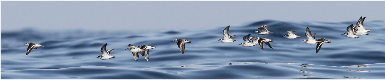
Red-necked Phalaropes at sea

04/11: We do a dolphin-tour by boat from Puerto Escondido, starting at 7 o'clock in the morning. Lots of Spinner Dolphins for a long time very close to the boat!