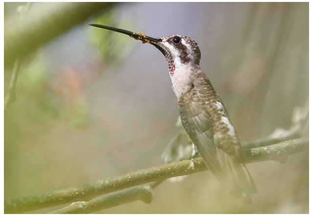
Plain-capped Starthroat 04/10 1m near Villa Rucaani, PE