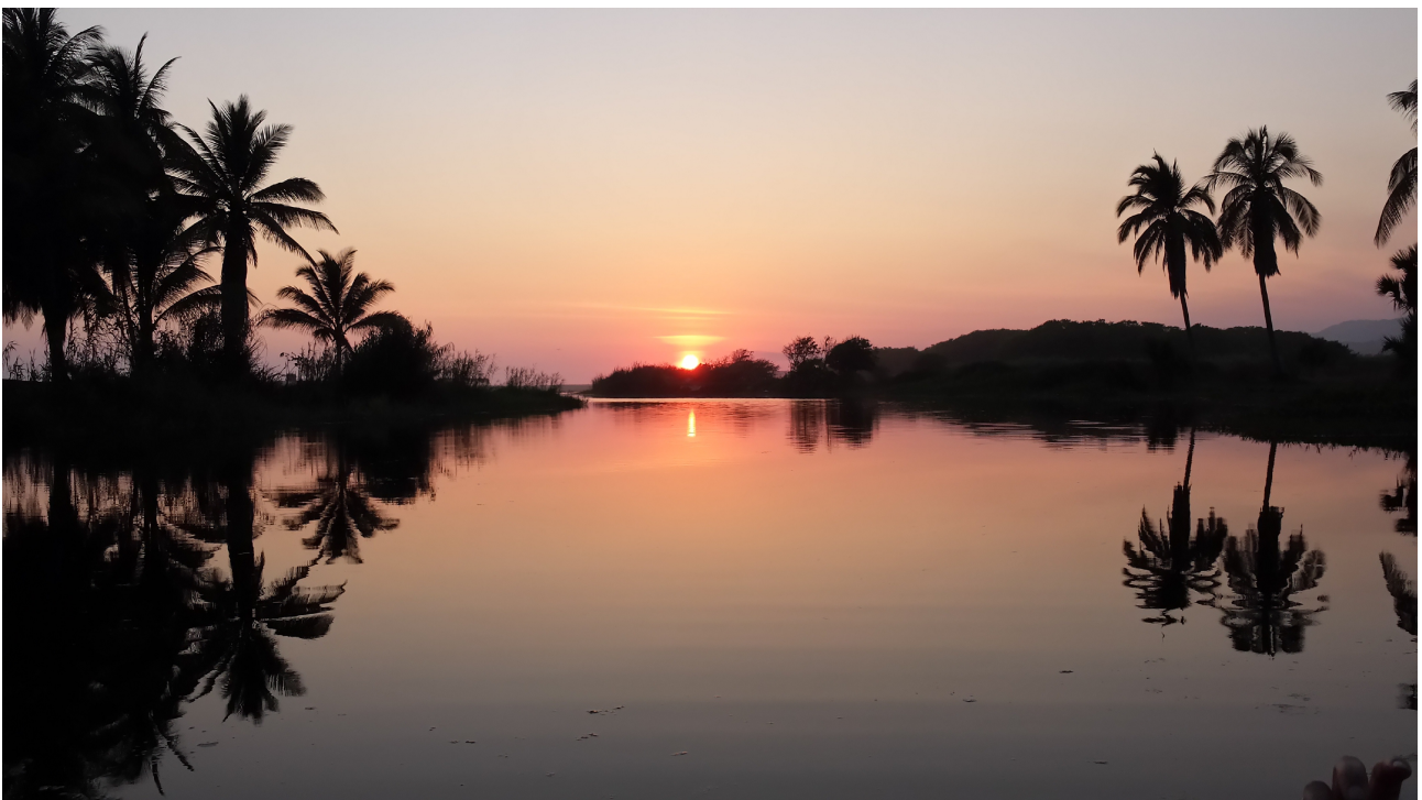
Beautiful Mexico !