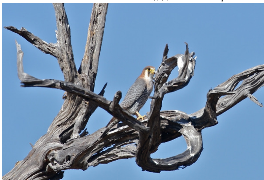
077 Red-necked Falcon 30/07 2 Pepere Island