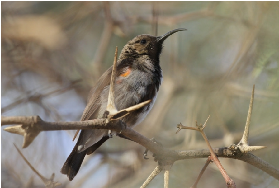
245 Dusky Sunbird 21-23/07 10+ Sesriem campsite

244 White-bellied Sunbird 29/07 1 m + Pepere Island