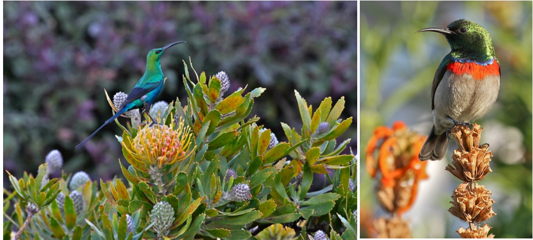
Malachite (left) and Southern Double-collared Sunbird

05/07: We drive through the Cape Point National Park . We find some Striped Mice on the terrasse of a restaurant, some Elands around, but to Valentin's disappointment no Baboons. In the evening, we take some tasty Fish and Chips from the Salty Sea Dog in Simon's Town.