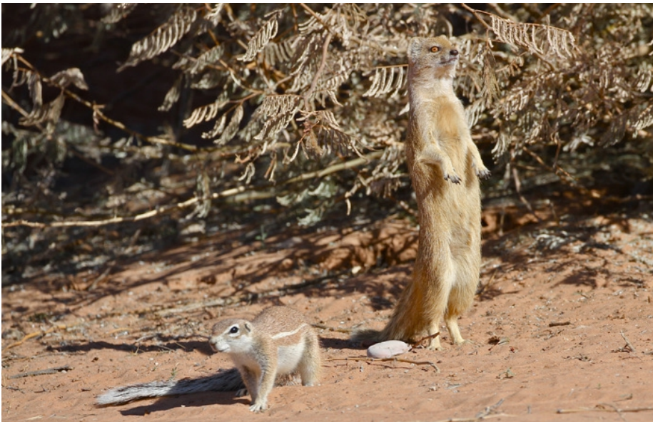
19 Yellow Mongoose 18 a. 19/07 + Kgalagadi Transfrontier Park - Camping