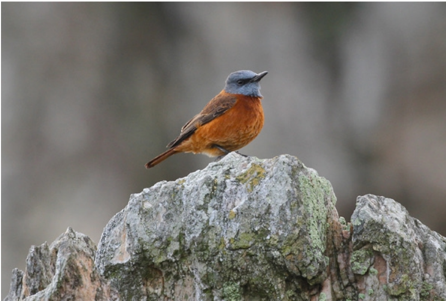
186 Cape Rock-Thrush 14/07 1 m, 1 f+ Sir Lowry's Pass

185 Groundscraper Thrush 18/07 1 way Augrabies Falls - Kgalagadi Transfr. Park