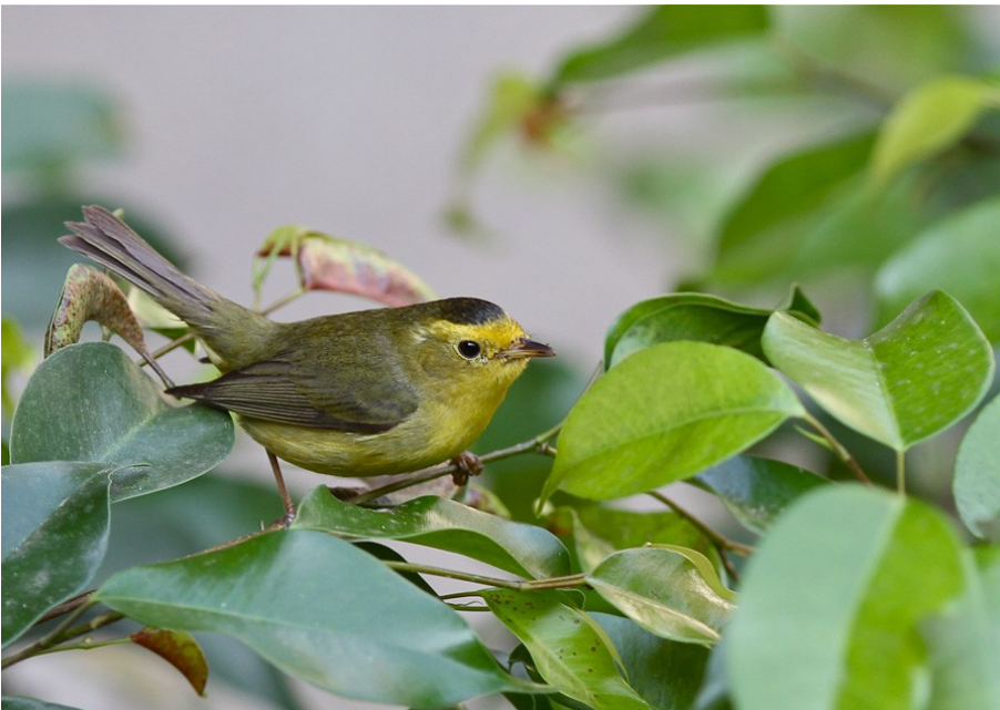
111 Wilson's Warbler 03/29 a. 30 1+ Oaxaca de Juárez