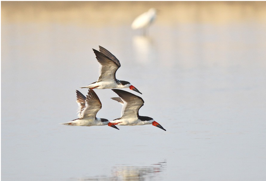
64 Black Skimmer 03/28 ca. 40 Colotepec River mouth

062 Common Tern 03/28 100s Colotepec River mouth 063 Black Tern 03/22 ca. 10 whale-watch-tour