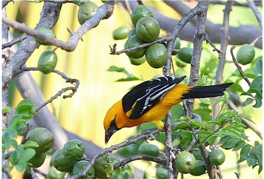
126 Altamira Oriole same as species before