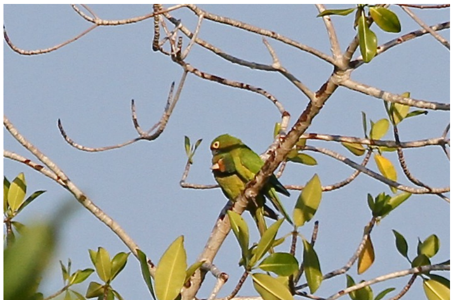
071 Orange-fronted Parakeet 03/27 2 La Ventanilla Lagoon

072 White-fronted Parrot 03/27 2 La Ventanilla Lagoon