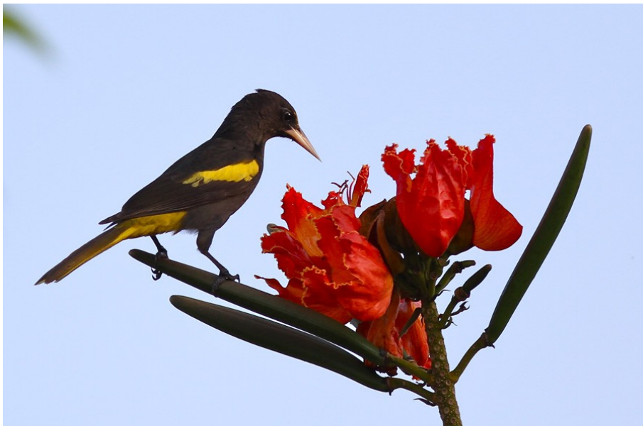
127 Yellow-winged Cacique seen daily in and around Puerto Escondido