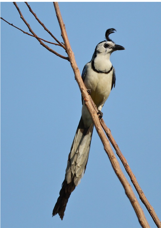
097 White-throated Magpie-Jay seen daily in Puerto Escondido, max. 4-5