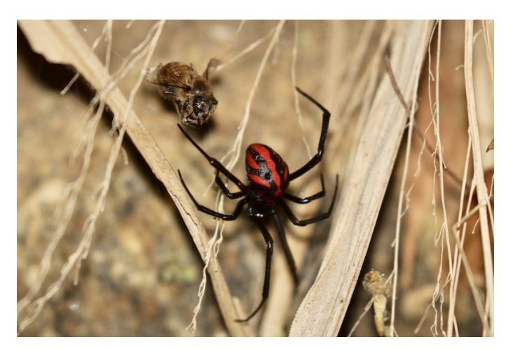
Southern Black Widow found 2 in the dry riverbed near nr. 169

Whip Spider spec. seen at several places.