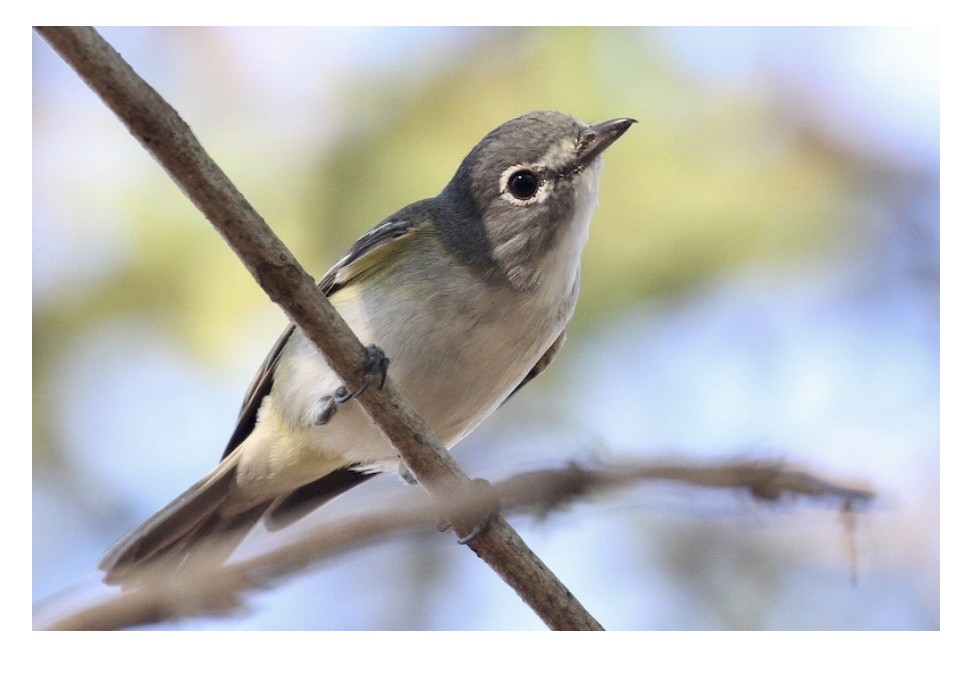
Plumbeous Vireo 04/06 1 Puerto Escondido