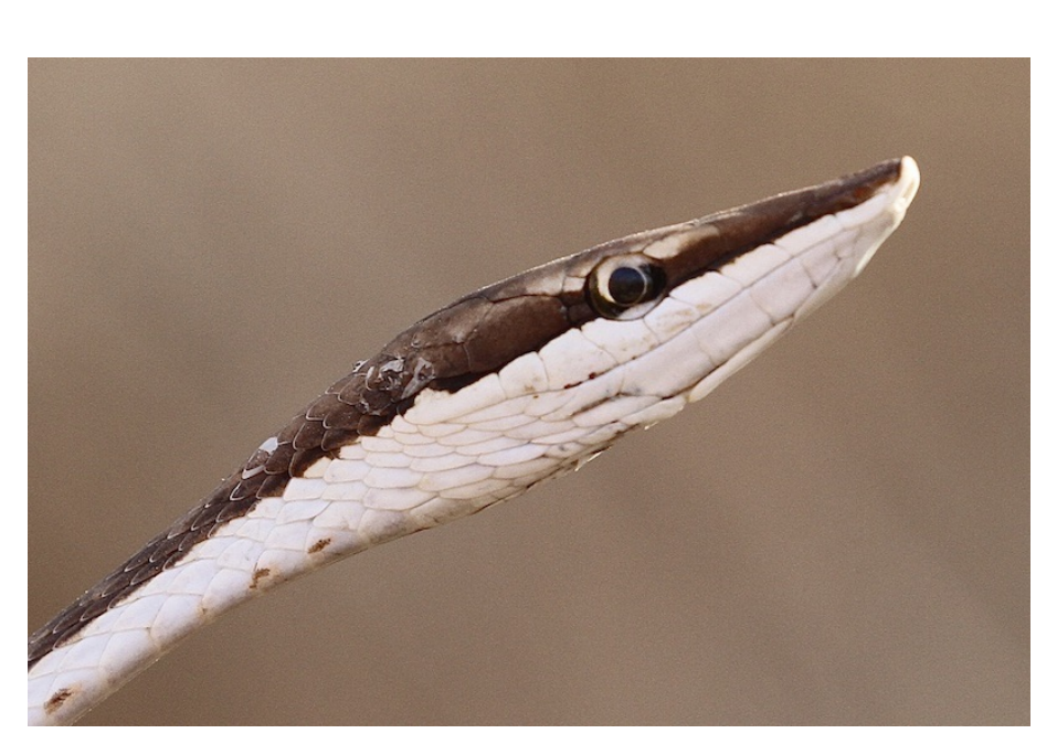
Mexican Vine Snake