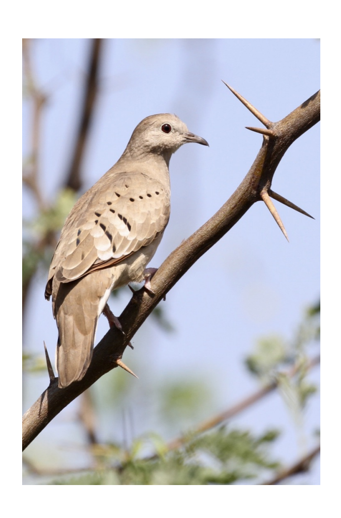
Ruddy Ground-Dove common in Puerto Escondido

very common in Coyoacán and Puerto Escondido