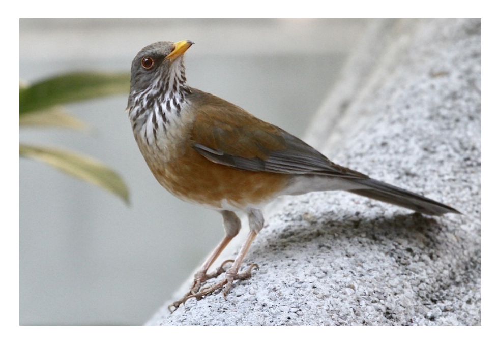
Rufous-backed Thrush common in Mexico-City and Puerto Escondido