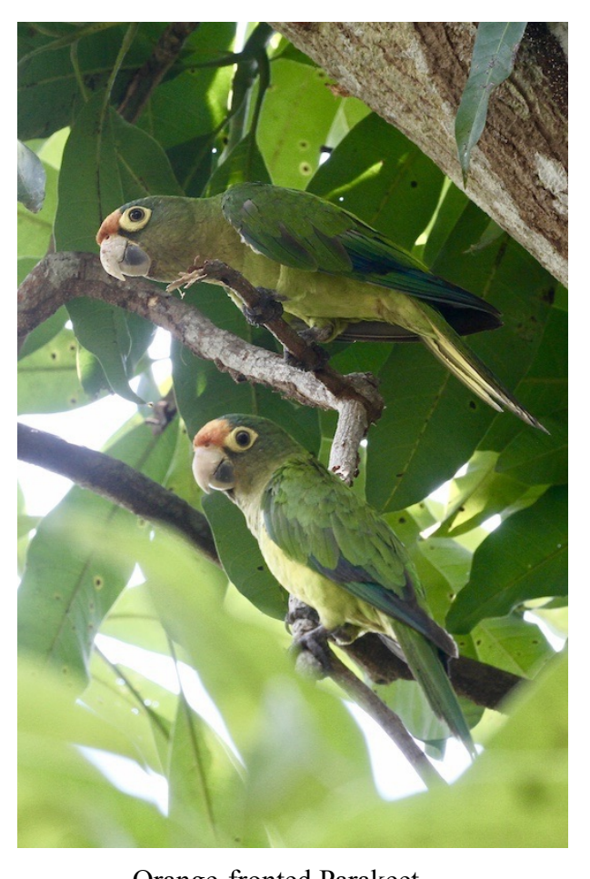
Orange-fronted Parakeet 04/06 7-10 Ventanilla Lagoon

seen +/- daily in and around Puerto Escondido Groove-billed Ani Ferruginous Pygmy-Owl heard in some nights in Puerto Escondido E of Colotepec rivermouth Mottled Owl 04/02 1 heard early morning Common Nighthawk 6+ hunting at dusk E of Colotepec rivermouth 04/07 Pauraque 04/06 1 heard Puerto Escondido 1 breeding (?) E of Colotepec rivermouth 04/07