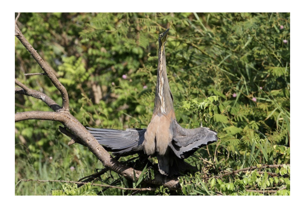
Bare-throated Tiger-Heron sunbathing 04/04 5+ Manialtepec Lagoon

Great Blue Heron regularly at Colotepec rivermouth, max. 5+ (03/31) 04/04 2-3+ Manialtepec Lagoon Great Egret regularly at Colotepec rivermouth, max. 10 (03/31) 04/03 Ventanilla Lagoon 04/04 Manialtepec Lagoon Snowy Egret regularly at Colotepec rivermouth, max. > 100 (03/30) 04/03 Ventanilla Lagoon 04/04 Manialtepec Lagoon Little Blue Heron regularly at Colotepec rivermouth, max. 3-5 (03/31) 04/03 1+Ventanilla Lagoon 04/04 2+ Manialtepec Lagoon