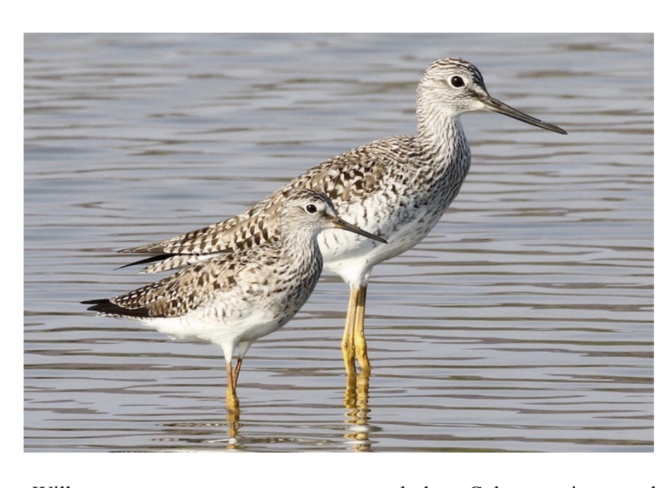
Lesser and Greater Yellowlegs

Willet regularly at Colotepec rivermouth, max. ~50-100 (03/30)