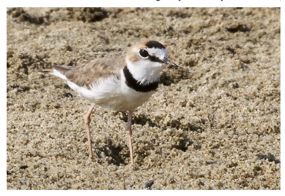
Collared Plover 04/04 1 ad., 1 pull. Manialtepec Lagoon

American Golden Plover regularly at Colotepec rivermouth, max. 4 (04/08)