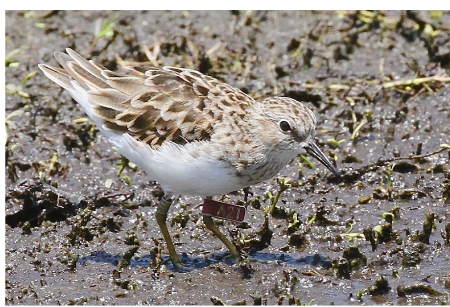
04/03 ~7-10 Ventanilla Lagoon, 1 ind. with red flag "A21"