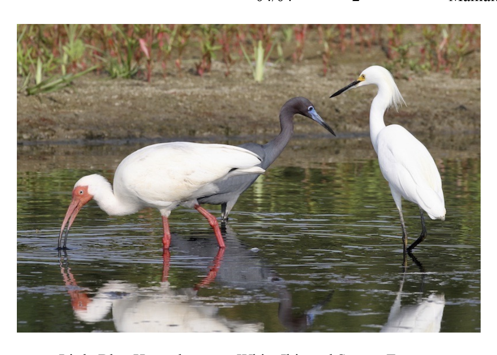
Little Blue Heron between White Ibis and Snowy Egret.

Great Blue Heron regularly at Colotepec rivermouth, max. 5+ (03/31) 04/04 2-3+ Manialtepec Lagoon Great Egret regularly at Colotepec rivermouth, max. 10 (03/31) 04/03 Ventanilla Lagoon 04/04 Manialtepec Lagoon Snowy Egret regularly at Colotepec rivermouth, max. > 100 (03/30) 04/03 Ventanilla Lagoon 04/04 Manialtepec Lagoon Little Blue Heron regularly at Colotepec rivermouth, max. 3-5 (03/31) 04/03 1+Ventanilla Lagoon 04/04 2+ Manialtepec Lagoon