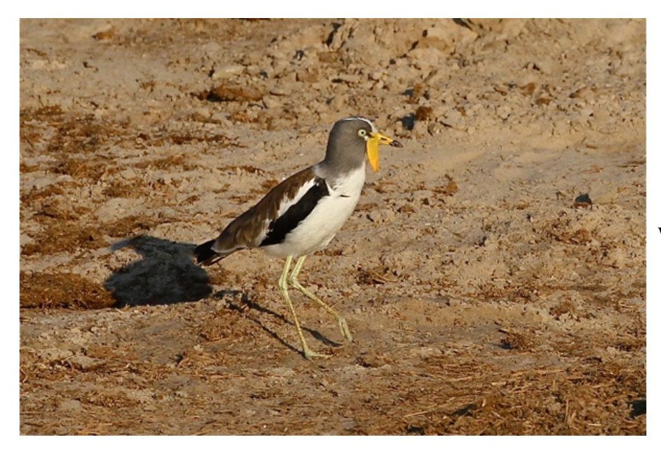
100 White-crowned Plover 01/08 4 Chobe NP