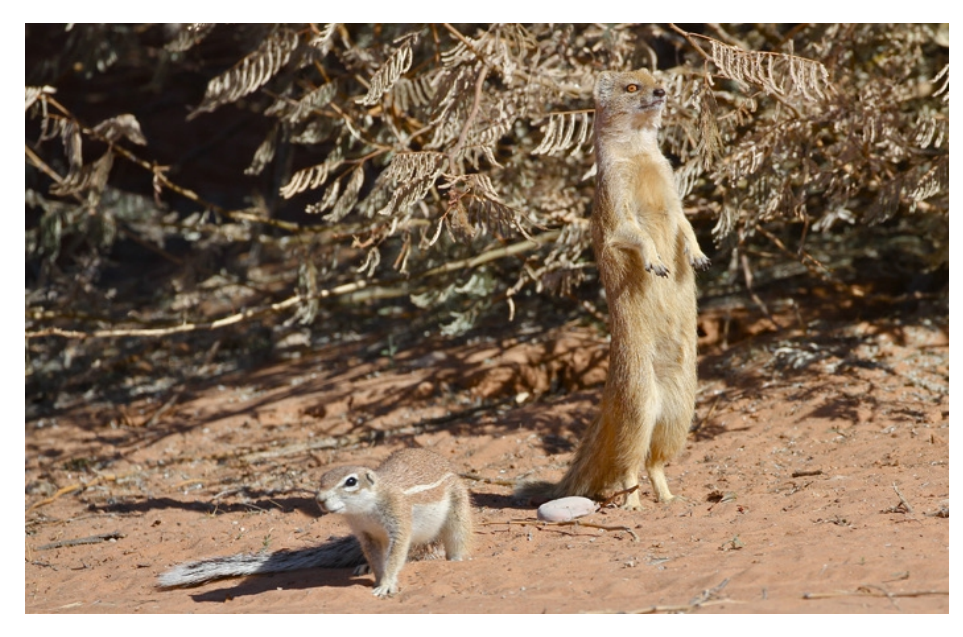
19 Yellow Mongoose 18 a. 19/07 + Kgalagadi Transfrontier Park - Camping