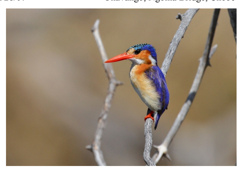
142 Malachite Kingfisher 28 a. 30/07 3+ close to Pepere Island