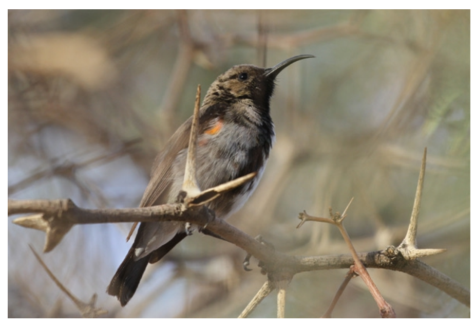
245 Dusky Sunbird 21-23/07 10+ Sesriem campsite