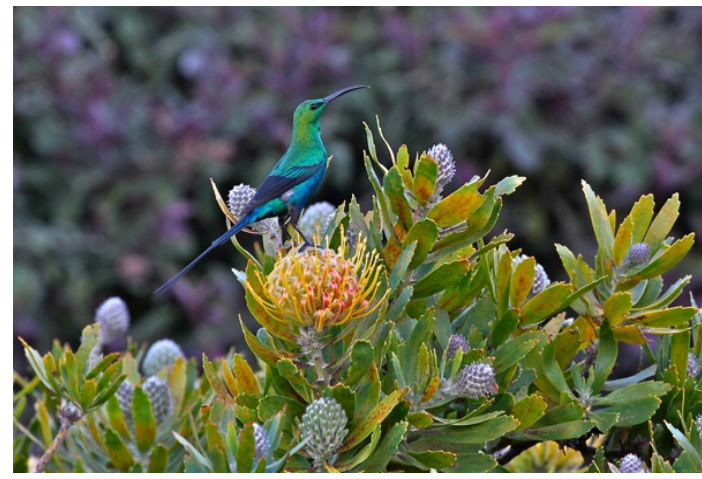
Malachite (left) and Southern Double-collared Sunbird

04/07: Arrival in Cape Town in the morning, first drive in left-winged traffic after many years, to our accomodation in Simon's Town - Rocklands . We walk to the penguin-colony of Boulders Bay , watch many penguins and Rock Dassies and the first Sunbirds.