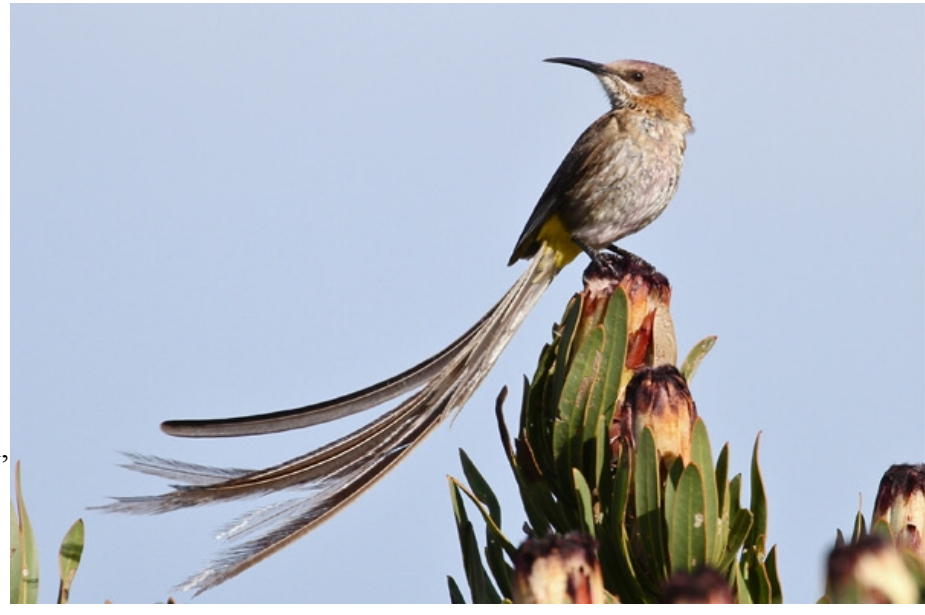
239 Cape Sugarbird + Cape region, so Cape Point NP, Simon's Town; not seen on Table Mountain, probably for missing flowers.