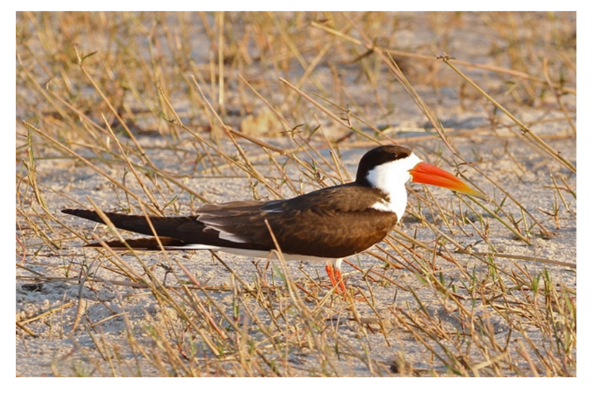
109 African Skimmer 01/08 20+, some breeding? Chobe NP