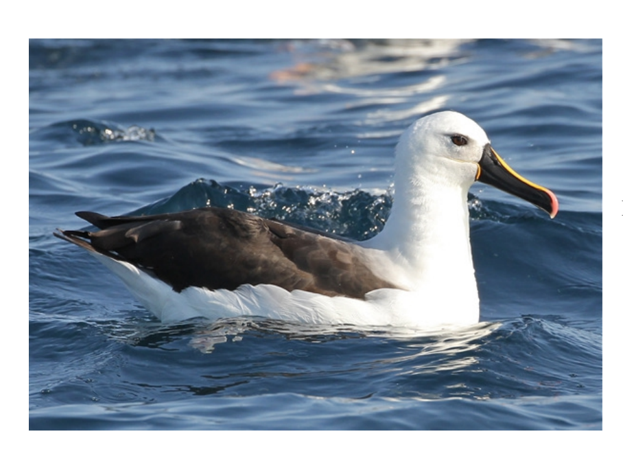
005 Indian Yellow-nosed Albatross 07/07 6+ Pelagic trip