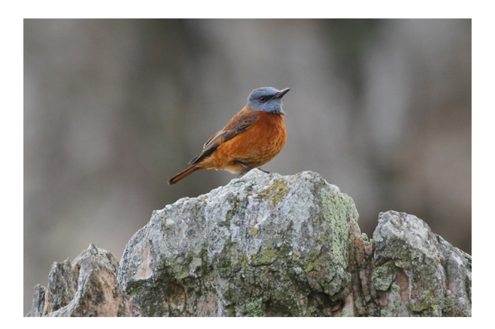
186 Cape Rock-Thrush 14/07 1 m, 1 f+ Sir Lowry's Pass