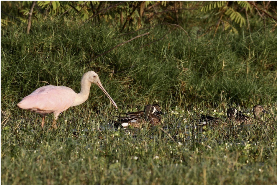
Roseate Spoonbill with Blue-winged Teals Manialtepec Lagoon

Roseate Spoonbill 03/31 & 04/02 1 immat. Colotepec rivermouth 04/04 3 Manialtepec Lagoon 04/07 & 04/08 2 Colotepec rivermouth