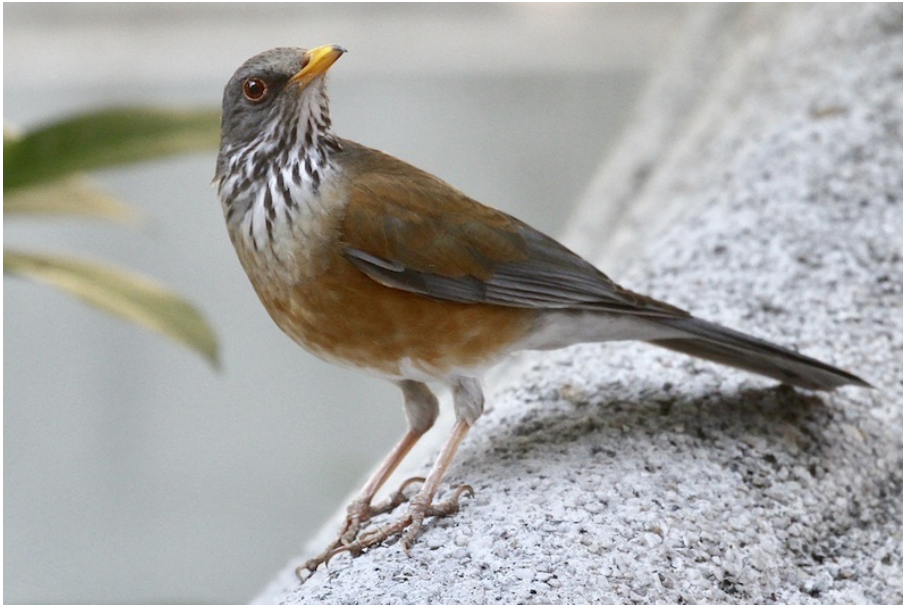
Rufous-backed Thrush common in Mexico-City and Puerto Escondido

Bewick's Wren 03/26 & 03/27 2-3 Xicotencatl-Parc/Coyoacán