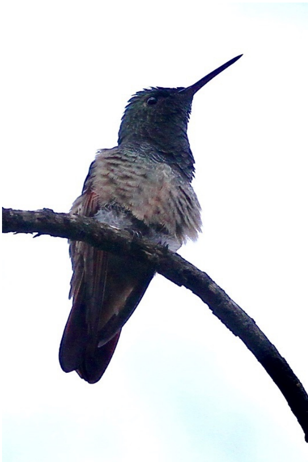
Garnet-throated Hummingbird 03/26 1 Xicotencatl-Parc/Coyoacán

seen on some occasions in Puerto Escondido