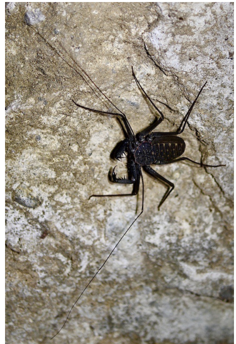
Whip Spider spec. seen at several places.