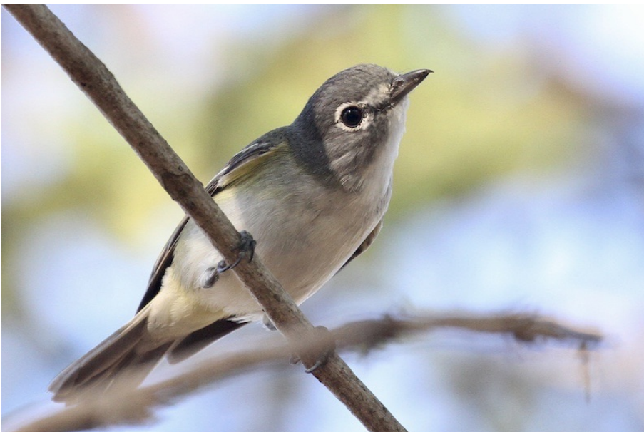
Plumbeous Vireo 04/06 1 Puerto Escondido

Mockingbird/Thrasher spec. 04/07 1 close to beach of Puerto Escondido