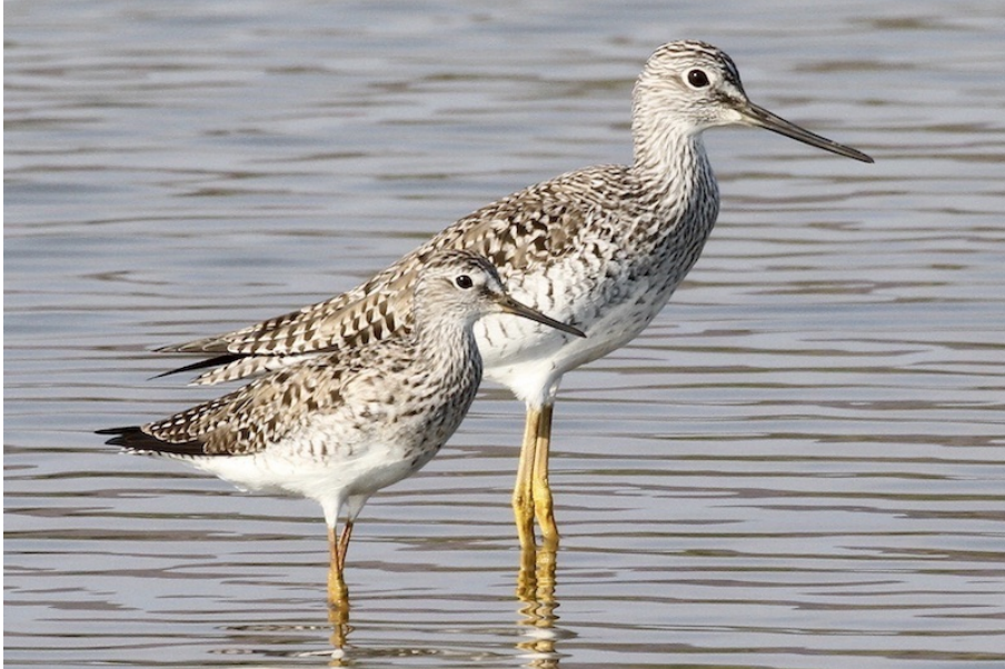
Lesser and Greater Yellowlegs