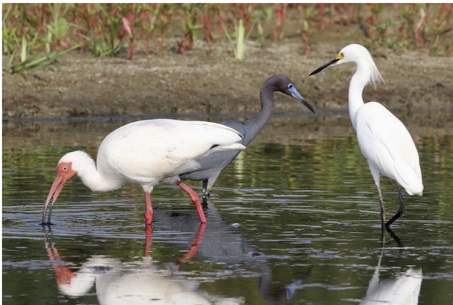
Little Blue Heron between White Ibis and Snowy Egret.

Little Blue Heron regularly at Colotepec rivermouth, max. 3-5 (03/31) 04/03 1+ Ventanilla Lagoon 04/04 2+ Manialtepec Lagoon