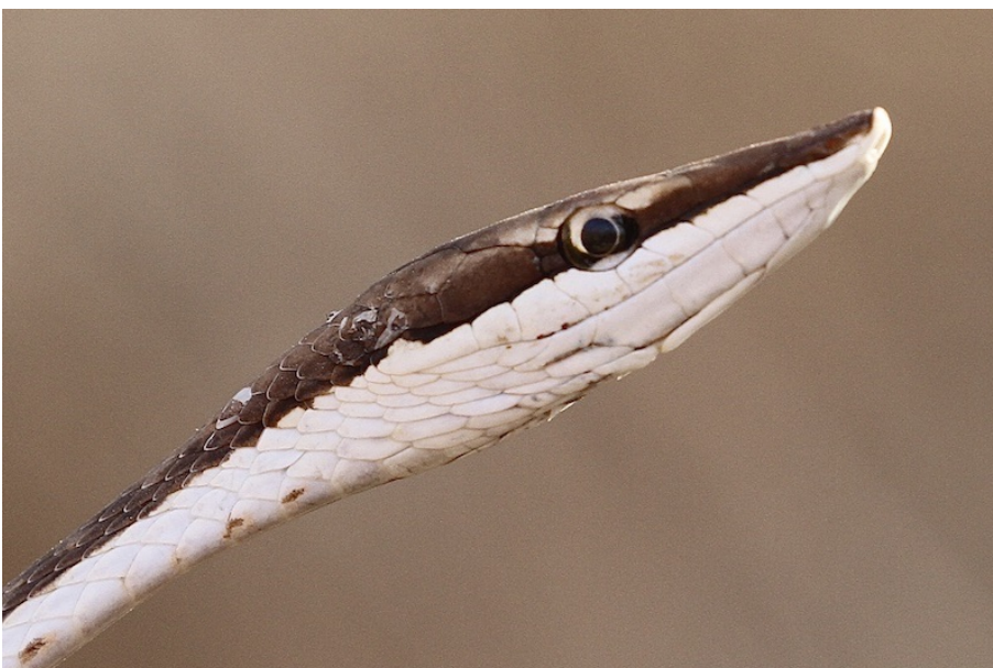
Mexican Vine Snake