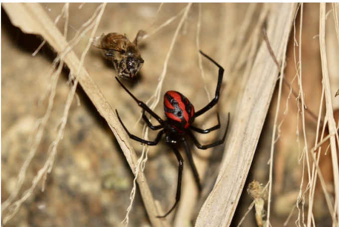
Southern Black Widow found 2 in the dry riverbed near nr. 169