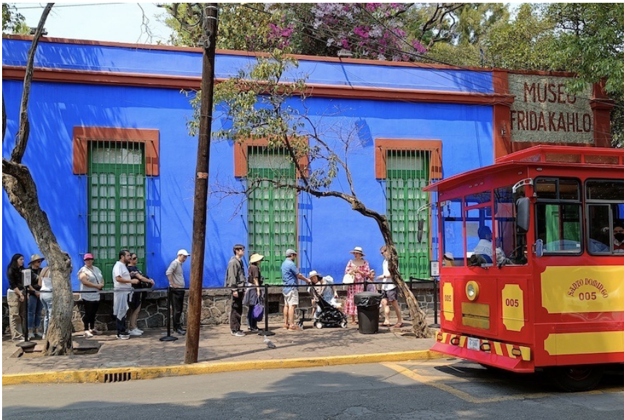
One of the most famous buildings of Mexico-City: The Frida-Kahlo-Museum.