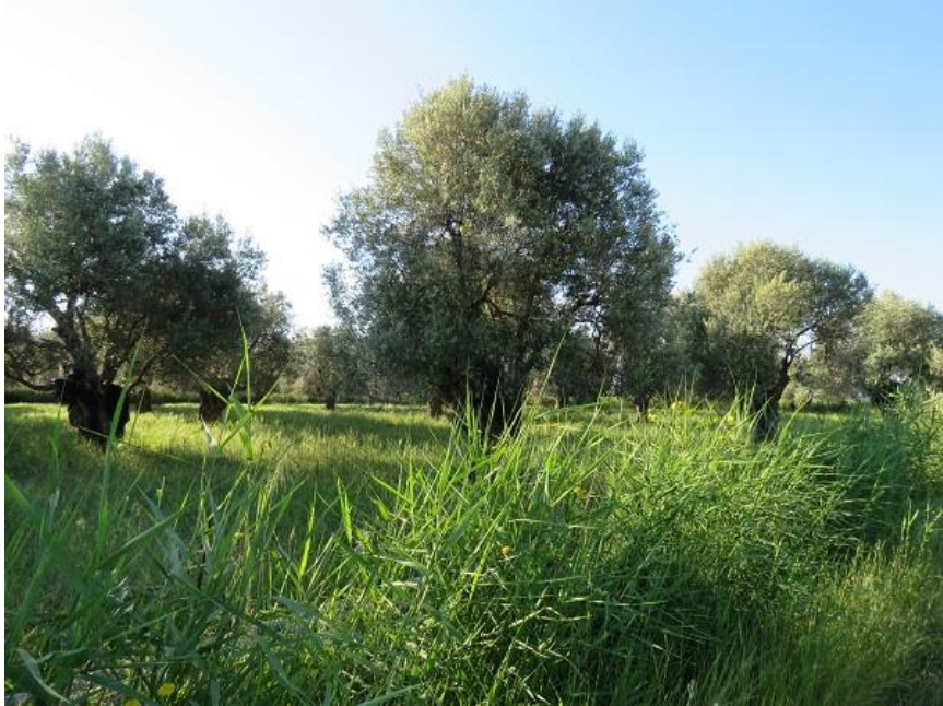
Parakila- Olive Groves