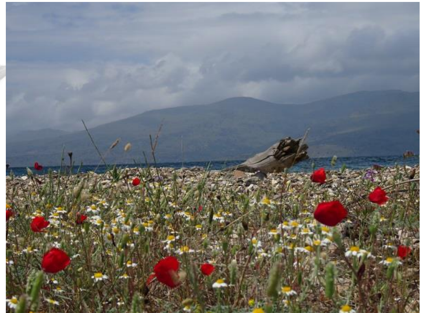
Polichnitos Salt pans