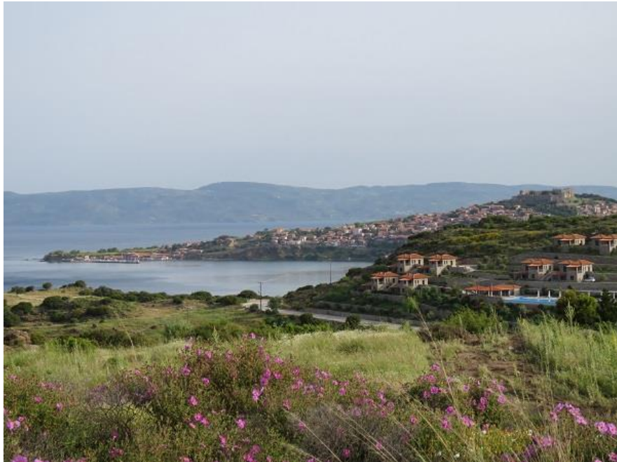
Kavaki- View to Molyvos Castle