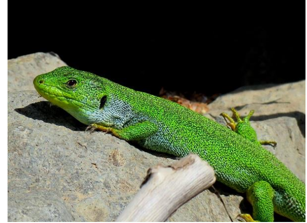
Balkan Green Lizard