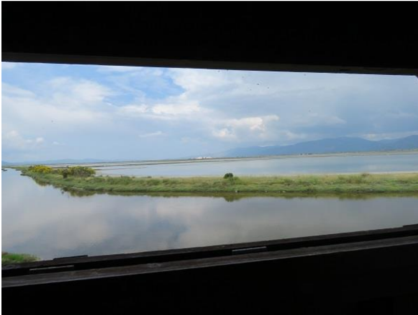
Kalloni Salt pans- View out of NE-Hide