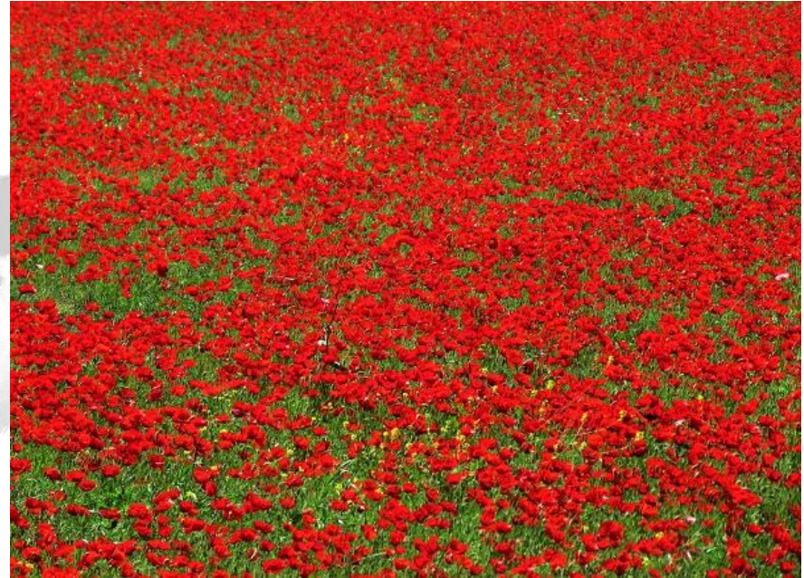
Achladeri-Field of Poppies