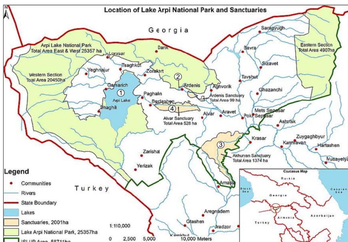
Figure 3: Lake Arpi National Park (Armenia)

Lake Arpi National Park is located in northern Armenia (Shirak Province). As Javakheti NP, the park is located on a volcanic plateau, with elevations of 2,000 masl and more. The plateau is a large grassland plain (alpine steppe) with wetlands and alpine lakes.