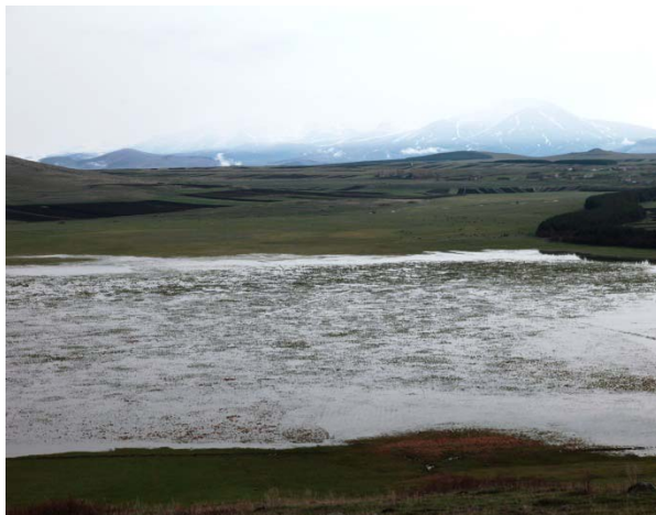
Wetland at Sulda